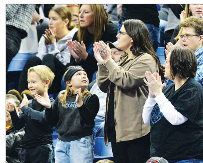
Rocket fans were on their feet during the opening match between the NR-S Rockets and the Our Redeemer's Knights on Thursday, Nov. 16.