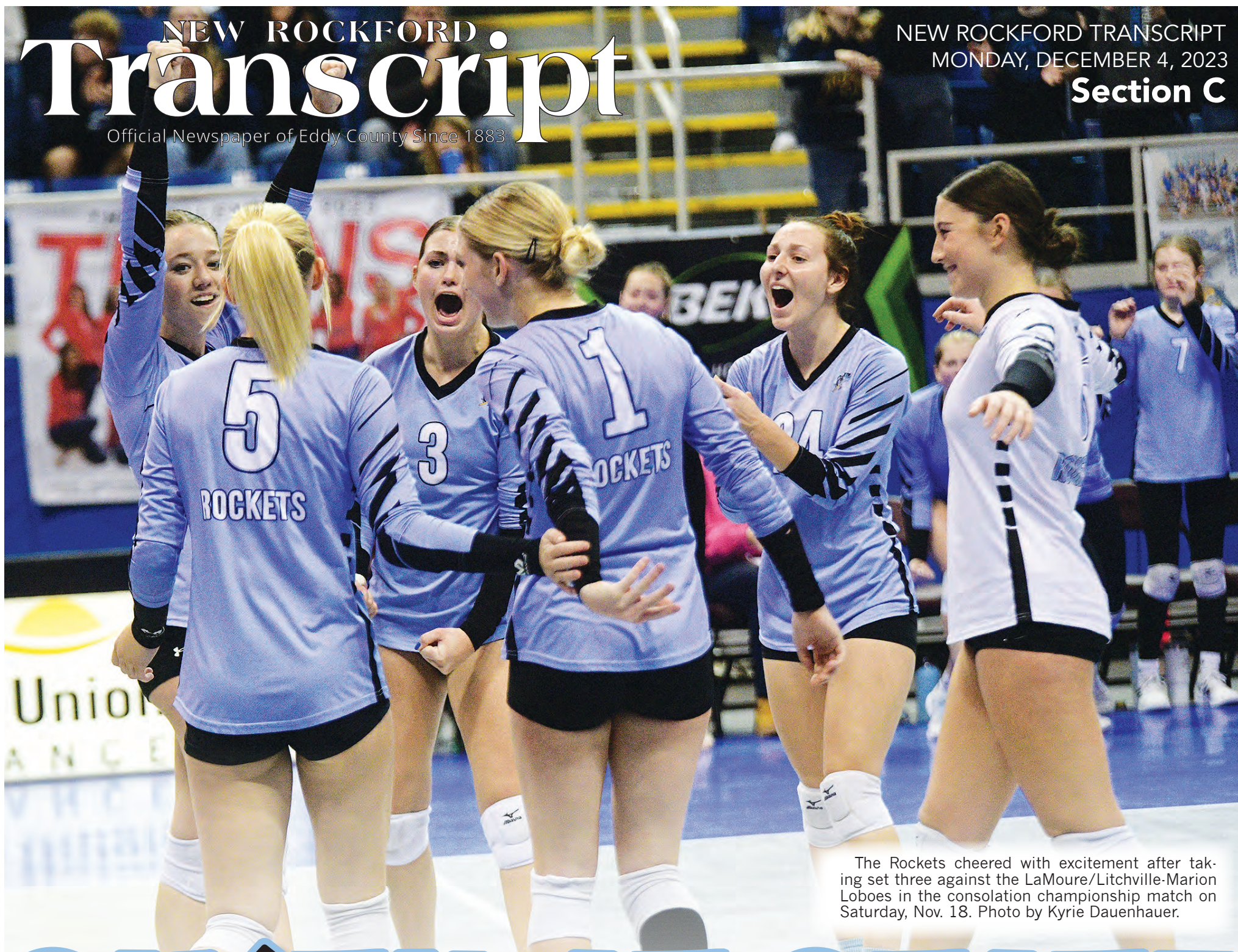
The Rockets cheered with excitement after taking set three against the LaMoure/Litchville-Marion Loboes in the consolation championship match on Saturday, Nov. 18.