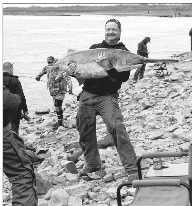
The current North Dakota record is a 131-pound fish snagged in 2016, snagger ID unknown.

The rostrum supports an electrosensory system that detects weak electrical fields. The rostrum, as well as the head and gill flaps, is covered with tiny sensory pores that detect the weak electrical field generated by small food organisms.