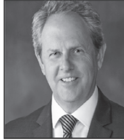
Rep. Don Vigesaa