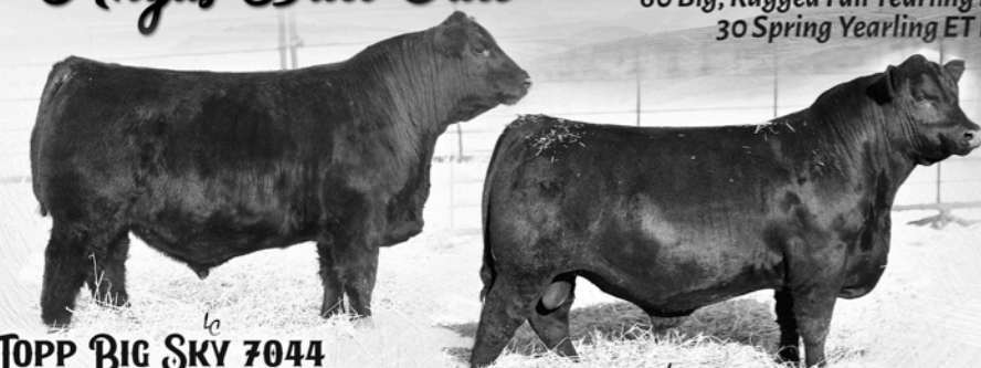
TOPP BIG SKY 7044 Musgrave Big Sky x TC Barbara 5016